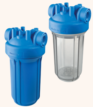
10" Big Filter Housing