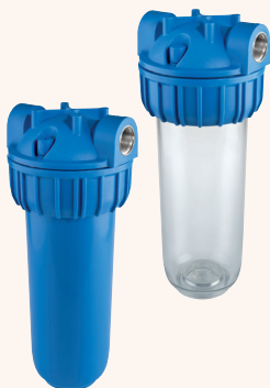
10" Three Piece Filter Housing