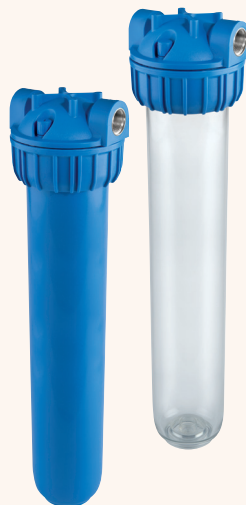
20" Three Piece Filter Housing